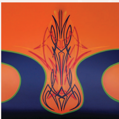
Hot PinStripe Efx™